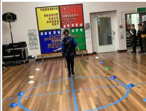
Nettlesworth Primary's UK Parliamentary Day 2023