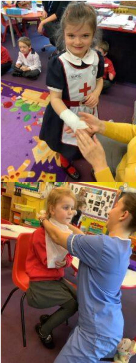
Class 5's Crisis Sleepover – 17.11.23