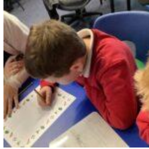
Harvest Festival – 24.10.23