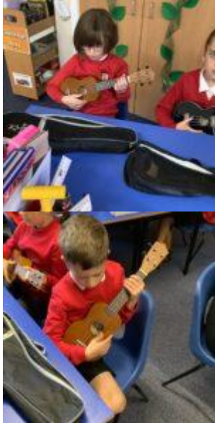
Native American Dreamcatchers in Class 4

In today's Art session, we used our previous plans for dreamcatchers to create some beautiful Native American inspired pieces. We've been